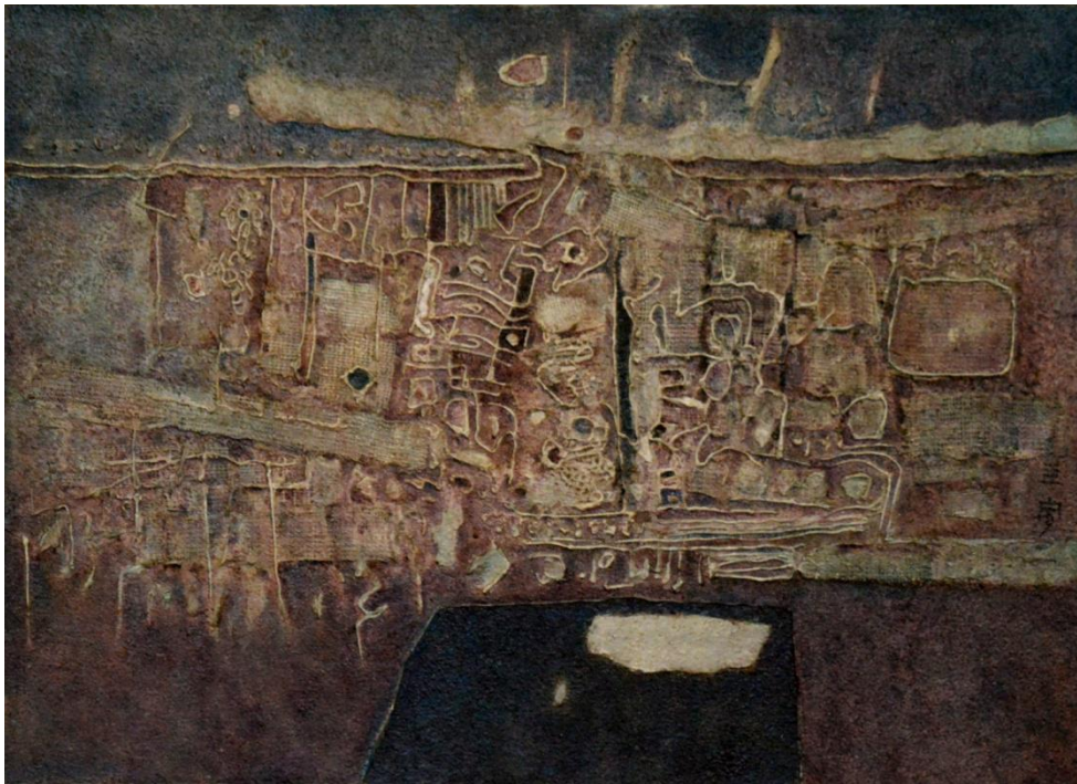
Scene , 1973, Mixed media, 88 x 92 cm