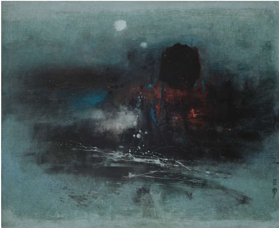
Nature , 1964, Oil on canvas, 81.5 cm x 100 cm

Here are the images to some of the exhibits: