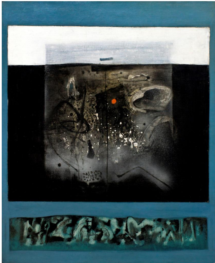
Action , 1973, Oil on canvas, 99 x 81.5 cm

231 Bain Street Bras Basah Complex #03-39 Singapore 180231 | +65 63364240 | +65 9747 9046 www.artcommune.com.sg | UEN 200909244C