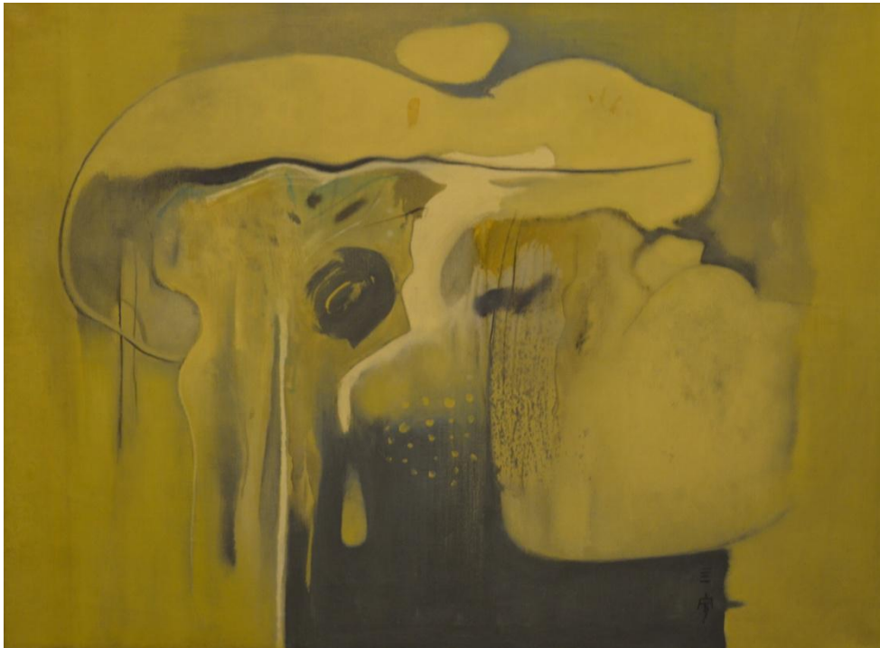
Inner Vision , 1967, Oil on canvas, 90 x 121 cm

231 Bain Street Bras Basah Complex #03-39 Singapore 180231 | +65 63364240 | +65 9747 9046 www.artcommune.com.sg | UEN 200909244C