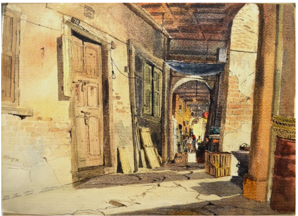
Ong Kim Seng, Old Warehouse (Beside Green Bridge), 1978, Watercolour on paper, 52 x 72.5 cm