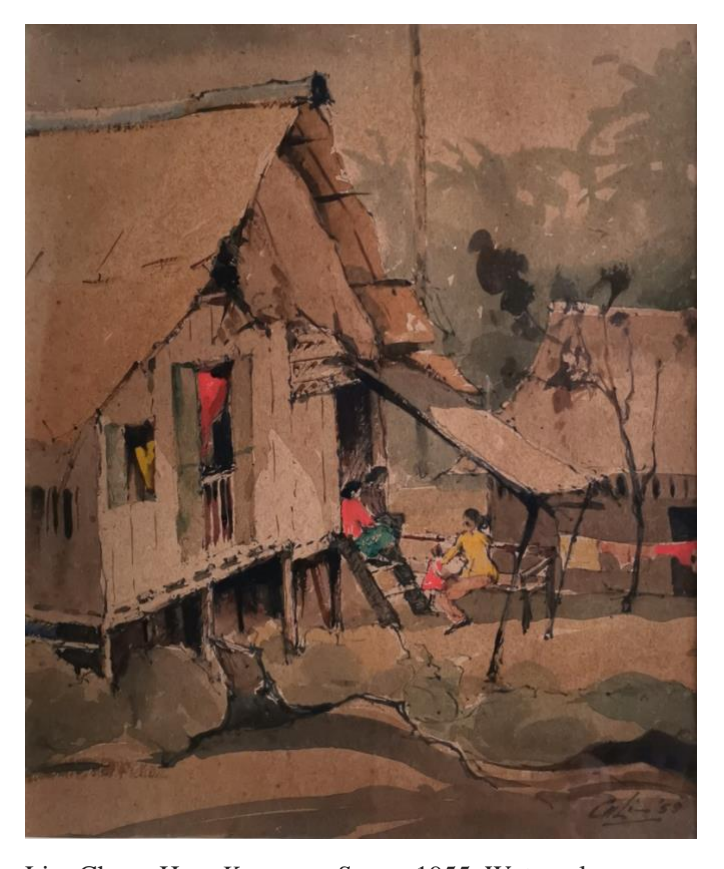
Lim Cheng Hoe, Kampong Scene, 1955, Watercolour on paper, 38 x 48 cm