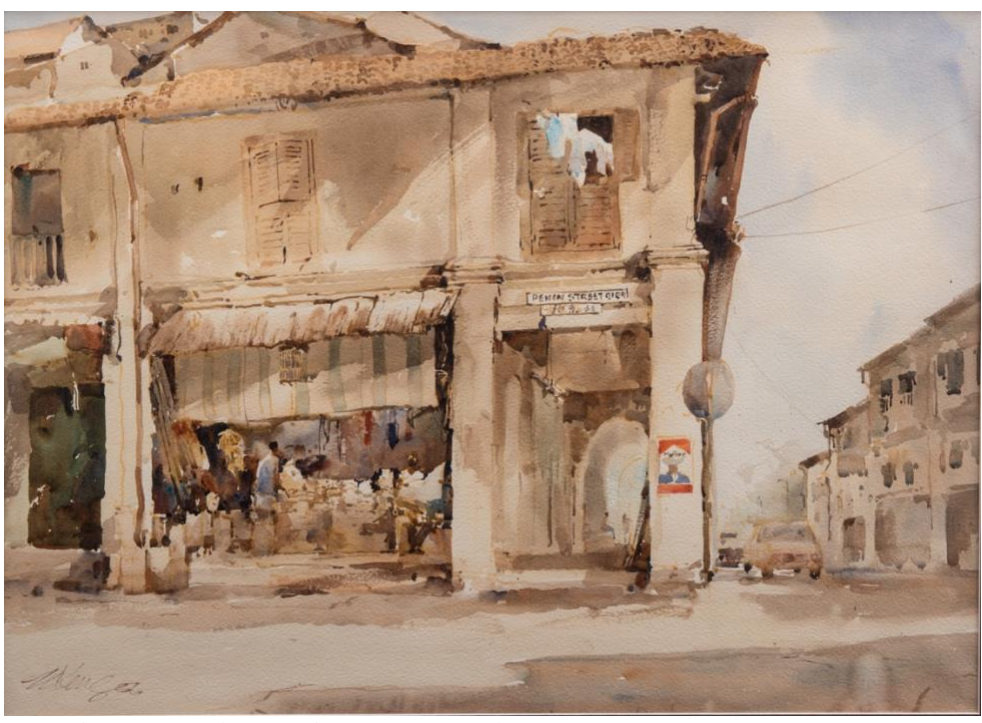
Ong Kim Seng, Pekin Road, 1986, Watercolour on paper, 53 x 73 cm