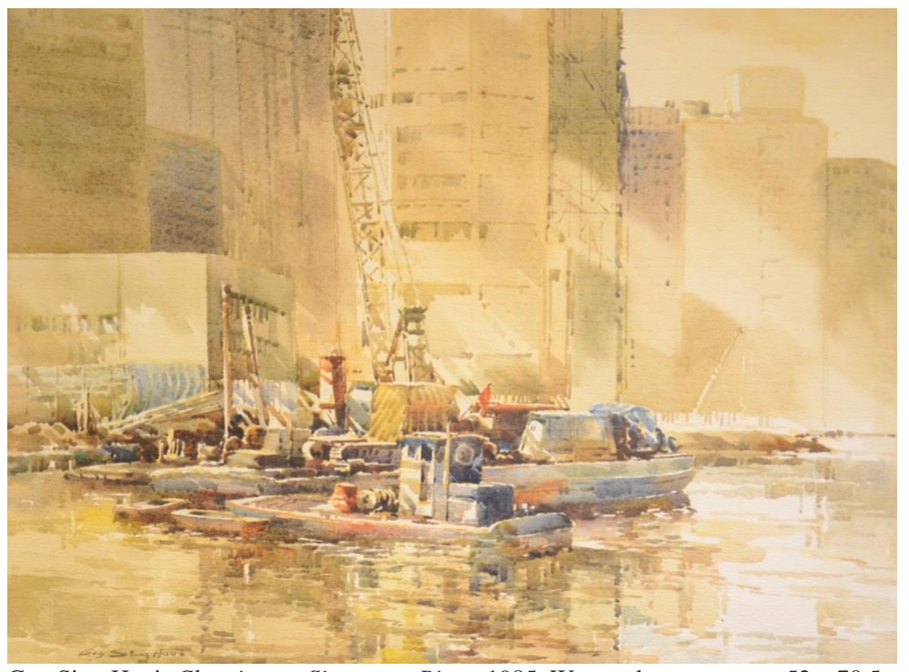
Gog Sing Hooi, Cleaning up Singapore River, 1985, Watercolour on paper, 52 x 70.5 cm