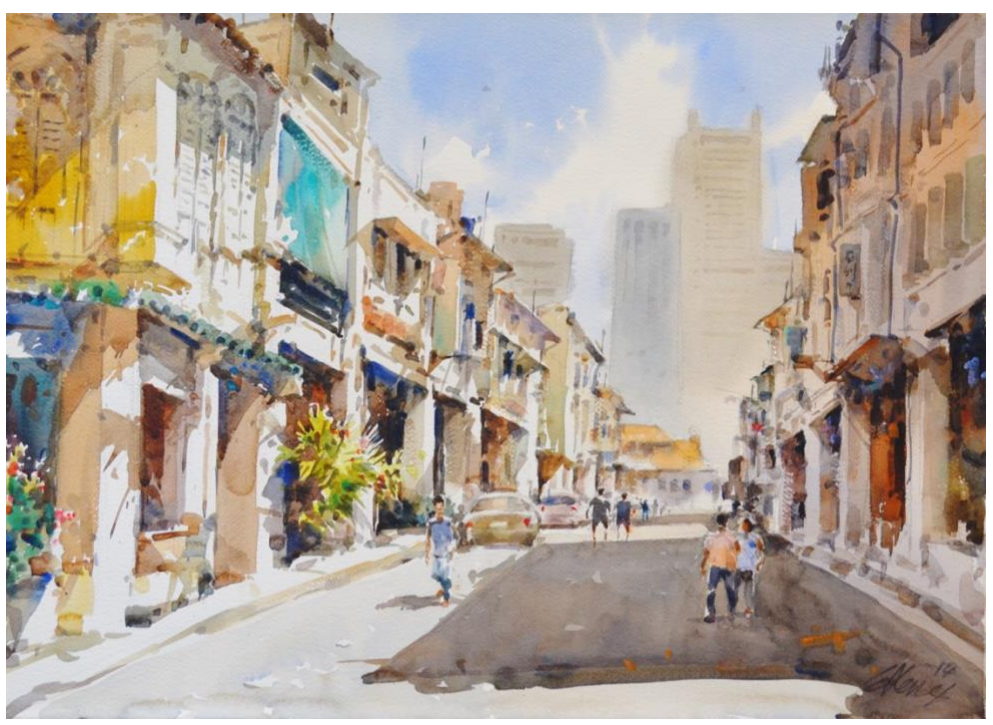
Ong Kim Seng, Club Street, 2014, Watercolour on paper, 53 x 73 cm