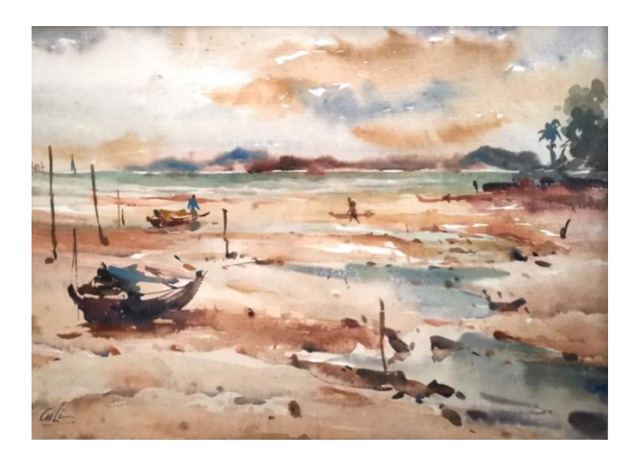
Lim Cheng Hoe, (Untitled) Seaside, Undated, Watercolour on paper, 29 x 40.5 cm