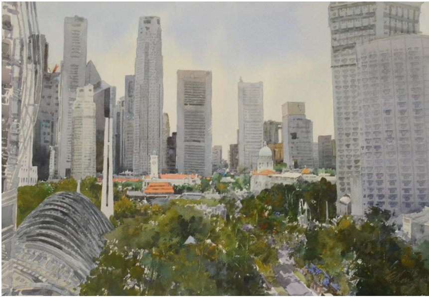
From JW Marriott, 2018, Watercolour on paper, 67 x 97 cm

231 Bain Street Bras Basah Complex #03-39 Singapore 180231 | +65 6336 4240 | +65 9747 9046 www.artcommune.com.sg | UEN 200909244C