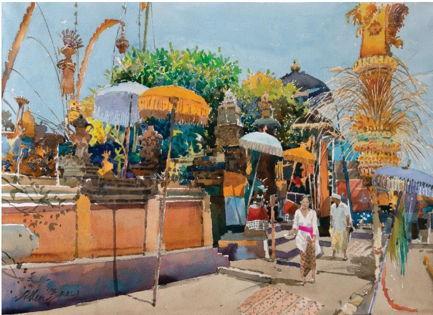
Festival, Bali , 2018, Watercolour on paper, 53 x 73 cm