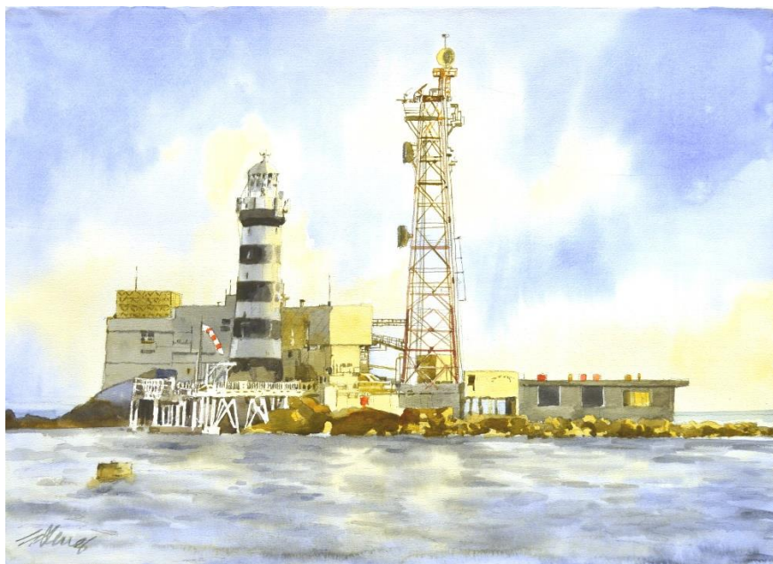
Horsburgh Lighthouse (Pedra Branca) , Watercolour on paper, 53 x 73 cm