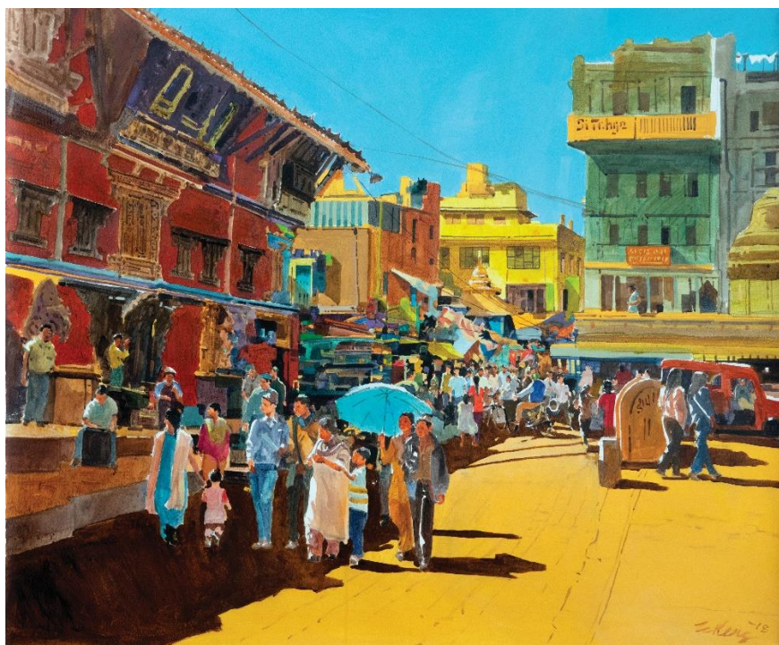
New Road, Nepal, 2018, Watercolour on paper, 100 x 120 cm