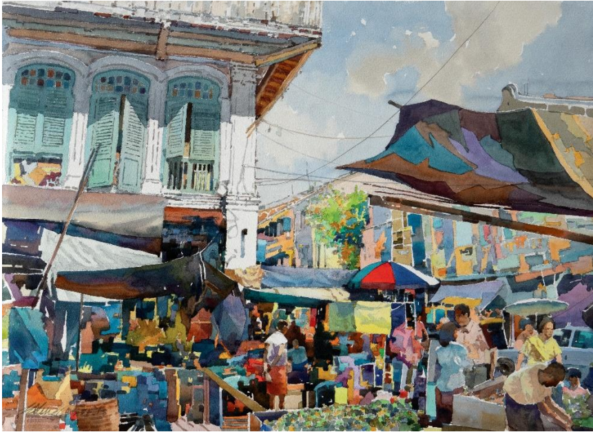
Street Stalls , 2018, Watercolour on paper, 53 x 73 cm

Here are some of the images to some of the artworks on exhibit: