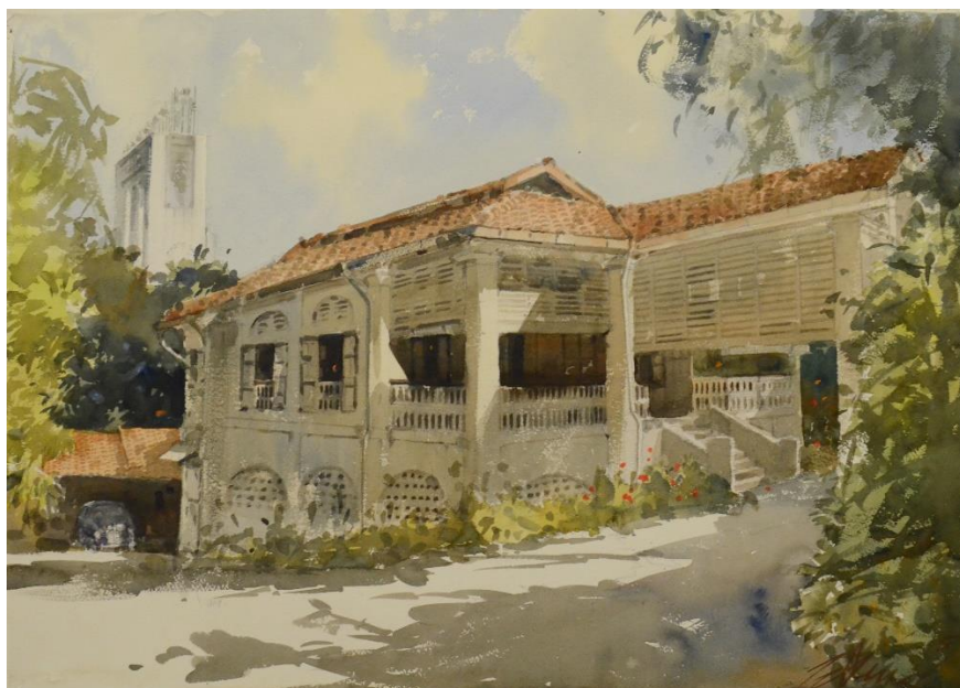
38 Oxley Road , 2015, Watercolour on paper, 53 x 74 cm

231 Bain Street Bras Basah Complex #03-39 Singapore 180231 | +65 6336 4240 | +65 9747 9046 www.artcommune.com.sg | UEN 200909244C