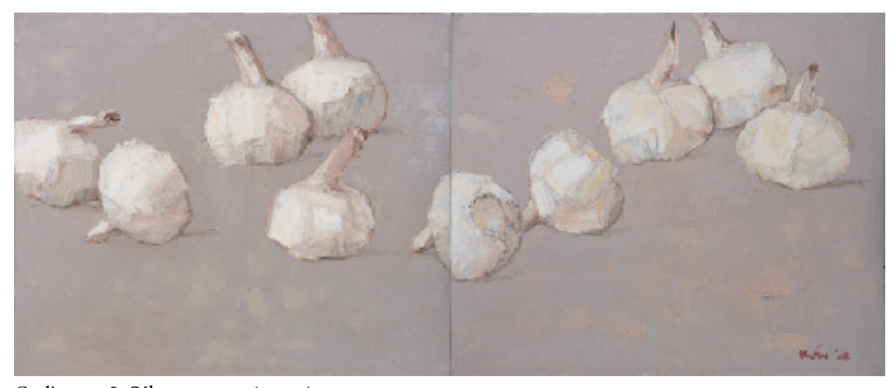
Garlics, 2008, Oil on canvas, 61 x 146 cm

mangosteens, durians - are treated with such dynamic and lively quality that we are inspired to examine their forms and essence with new understanding and fresh eyes. Likewise, vegetables and spices like cabbages, corns, bell peppers and garlics transcend their everyday mundanity and perishable status, and are accorded a monumentality that reminds us to enjoy the wondrous yet purposeful forms evolved from nature.