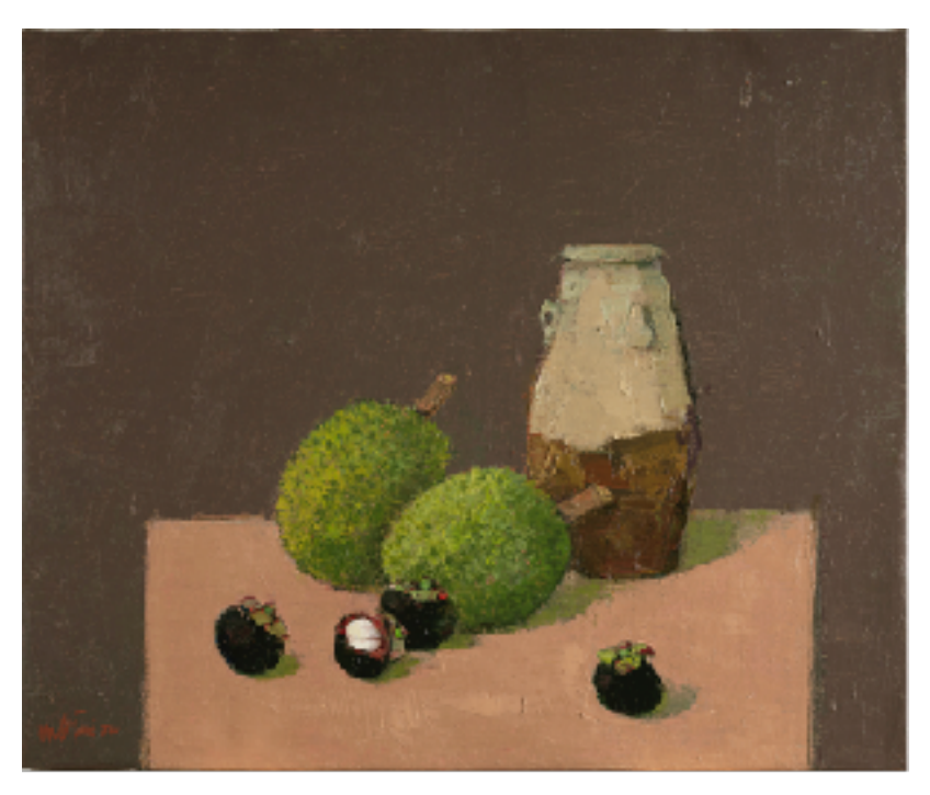
Durians and Mangosteens, 2020, Oil on canvas, 60.5 x 72.5 cm