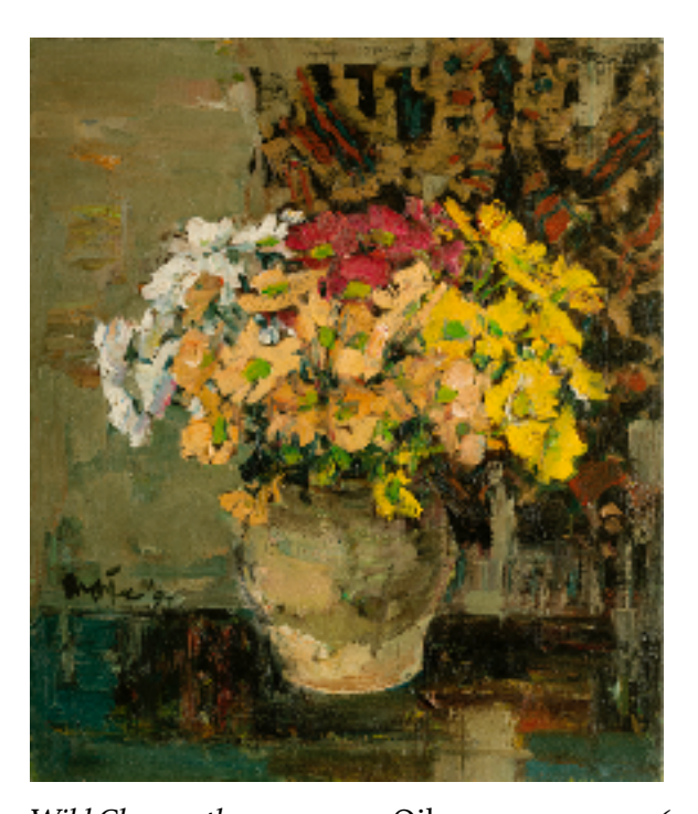
Wild Chrysanthemum, 1994, Oil on canvas, 53 x 46 cm

Here are the images to some of the artworks on exhibit: