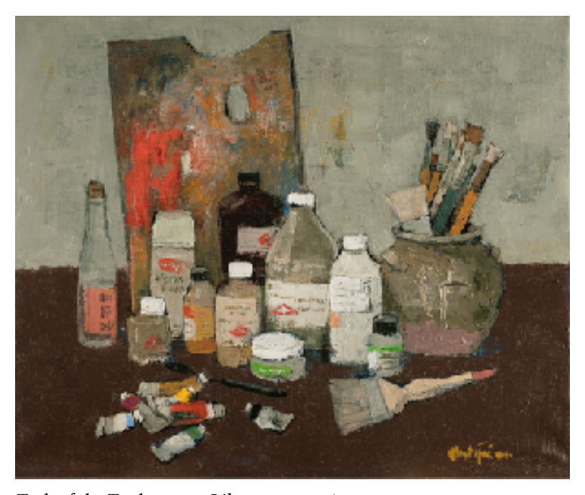
Tools of the Trade, 2020, Oil on canvas, 60.5 \times 72.5 \text{ cm}