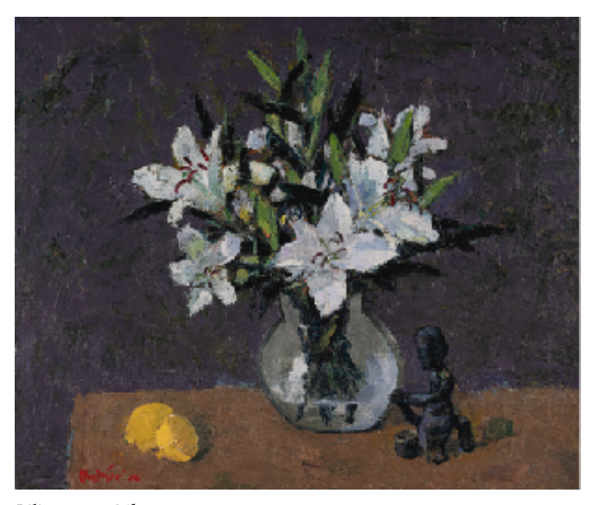
Lilies , 2019, Oil on canvas, 60 x 72.5 cm