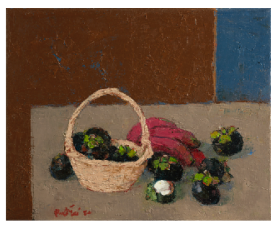
Mangosteens and Red Bananas, 2020, Oil on canvas, 40 x 50 cm