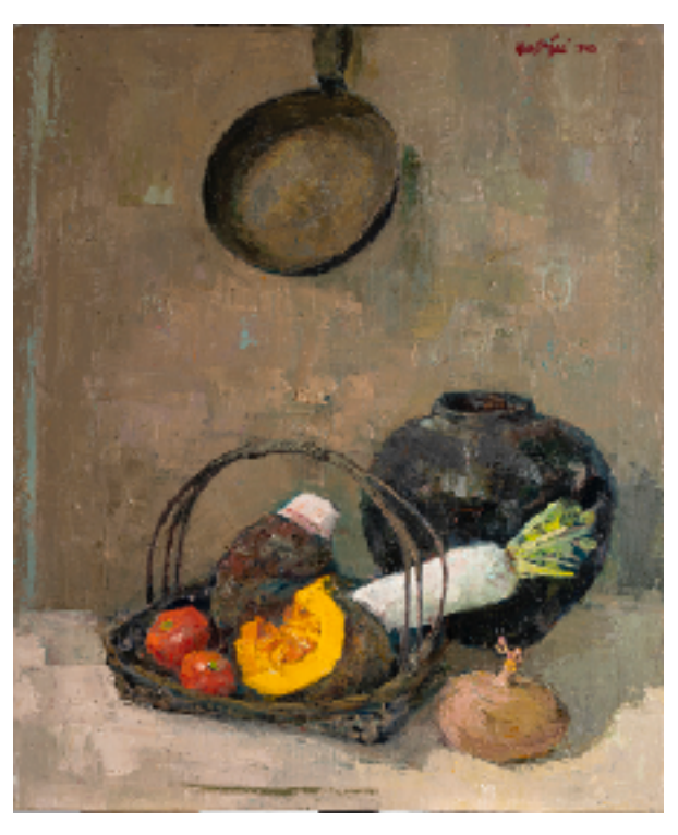
Harvest , 2020, Oil on canvas, 72.5 x 60.5 cm