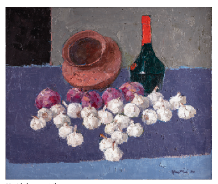
Untitled, 2020, Oil on canvas, 60 x 72 cm