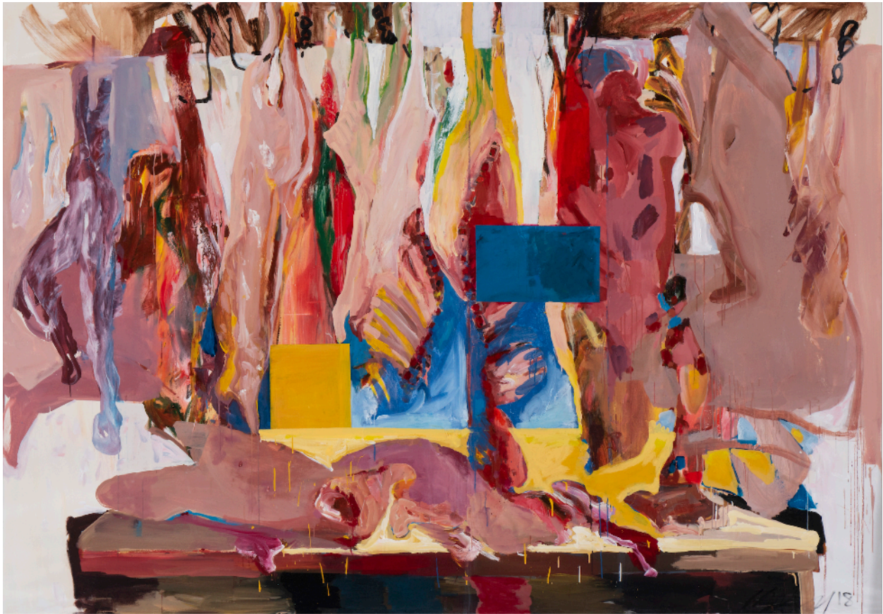
The Meat Stall , 2018, Acrylic on canvas, 215 x 305 cm