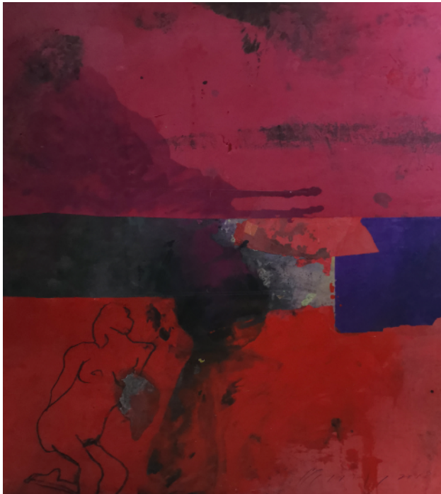
Red Dawn , 2018, Mixed media (collage), 107 x 90 cm