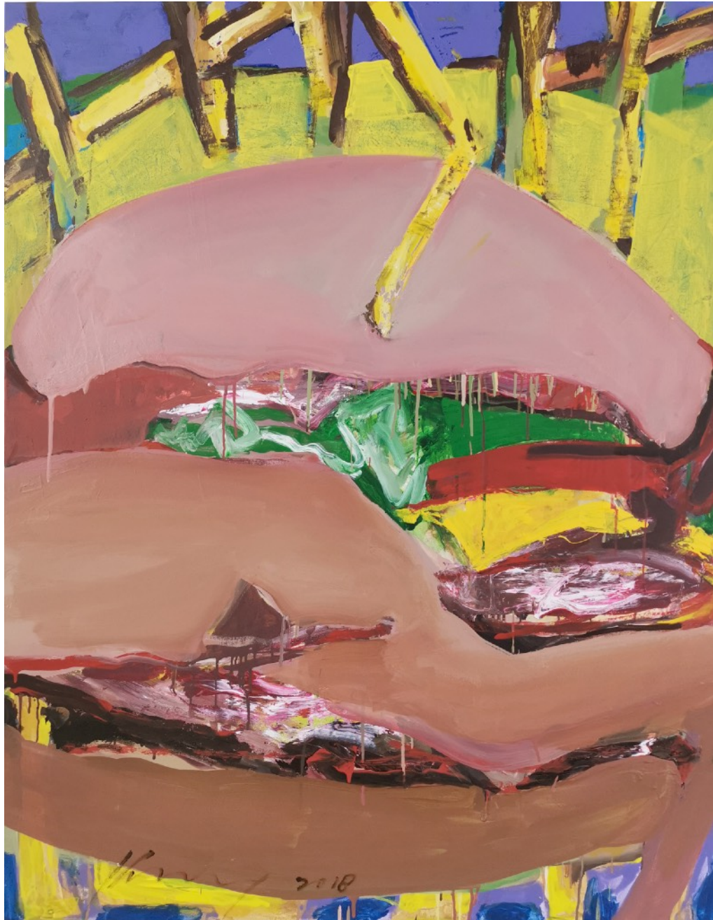
To Fry or Not to Fry II , 2018, Acrylic on canvas, 147.5 x 115 cm

76 Bras Basah Road #01-01 Carlton Hotel Singapore 189558 | +65 6336 4240 | +65 9747 9046 www.artcommune.com.sg | UEN 200909244C