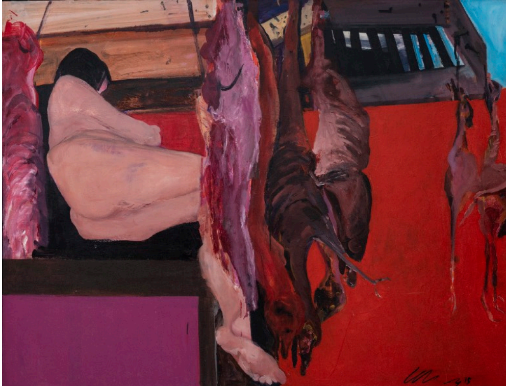
The Butcher's Wife , 2015, Acrylic on canvas, 121 x 161 cm

76 Bras Basah Road #01-01 Carlton Hotel Singapore 189558 | +65 6336 4240 | +65 9747 9046 www.artcommune.com.sg | UEN 200909244C