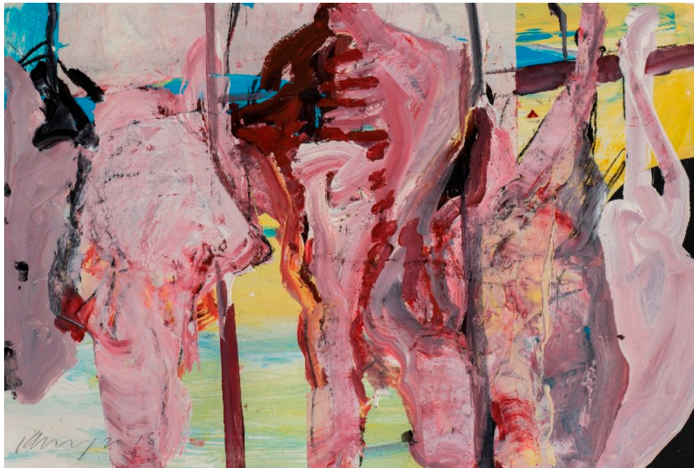
Nice Meat , 2018, Mixed media, 63 x 93 cm

Here are the images to some of the exhibits: