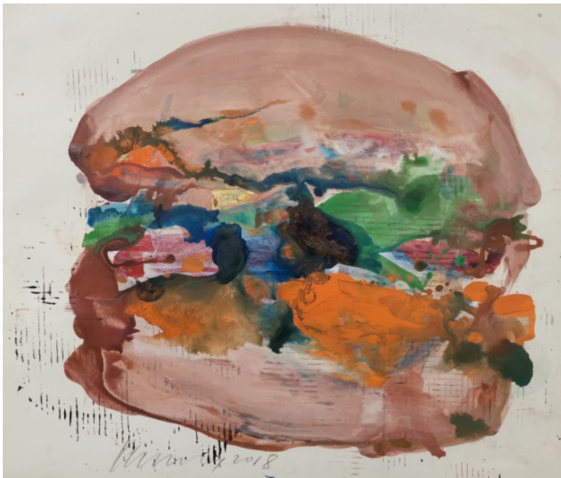
Meat Burger , 2018, Acrylic on paper, 55 x 63 cm